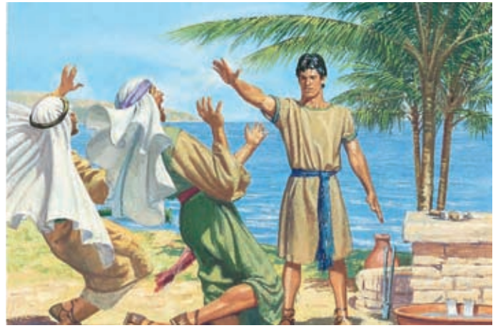
Then the Lord told Nephi to touch Laman and Lemuel. When Nephi did, the Lord shocked them. Laman and Lemuel knew the power of God was with Nephi. 1 Nephi 17:53–55