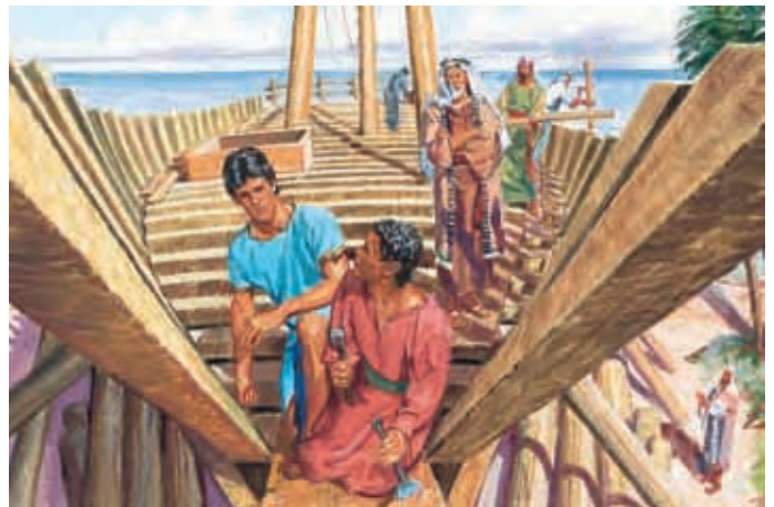
Laman and Lemuel repented and helped Nephi build the ship. 1 Nephi 18:1