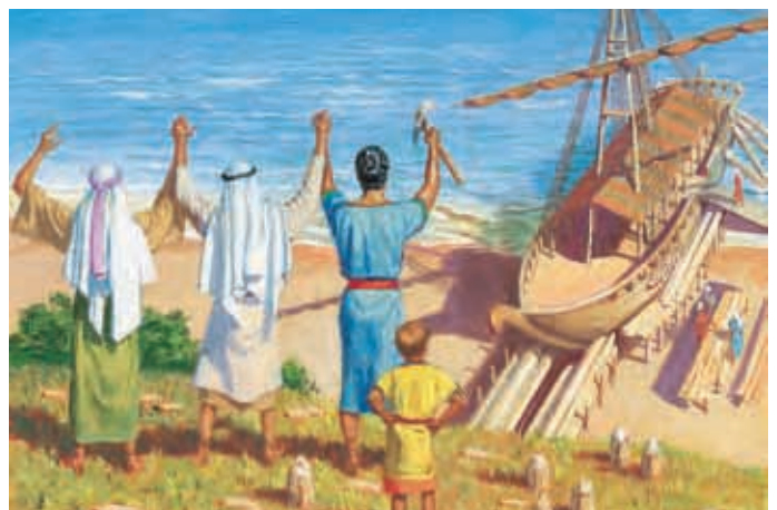
When Nephi and his brothers had finished building the ship, they knew it was a good ship. They thanked God for helping them. 1 Nephi 18:4