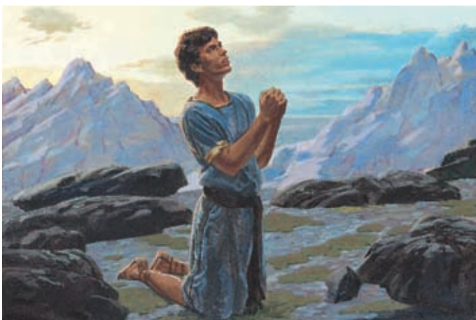
Nephi went to the mountain many times to pray for help. The Lord taught him how to build the ship. 1 Nephi 18:3