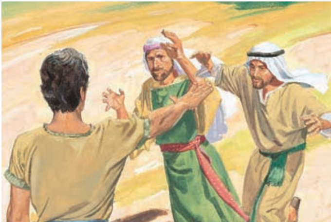
As they came toward Nephi, he commanded them not to touch him because he was filled with the power of God. Laman and Lemuel were afraid for many days. 1 Nephi 17:48, 52