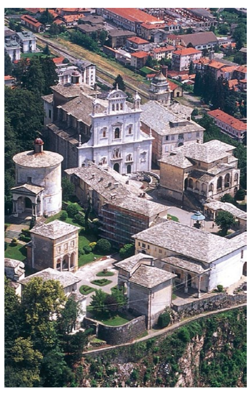
A modern-day photograph of the Piedmont region of Italy, where Elder Lorenzo Snow served as a missionary in the early 1850s.