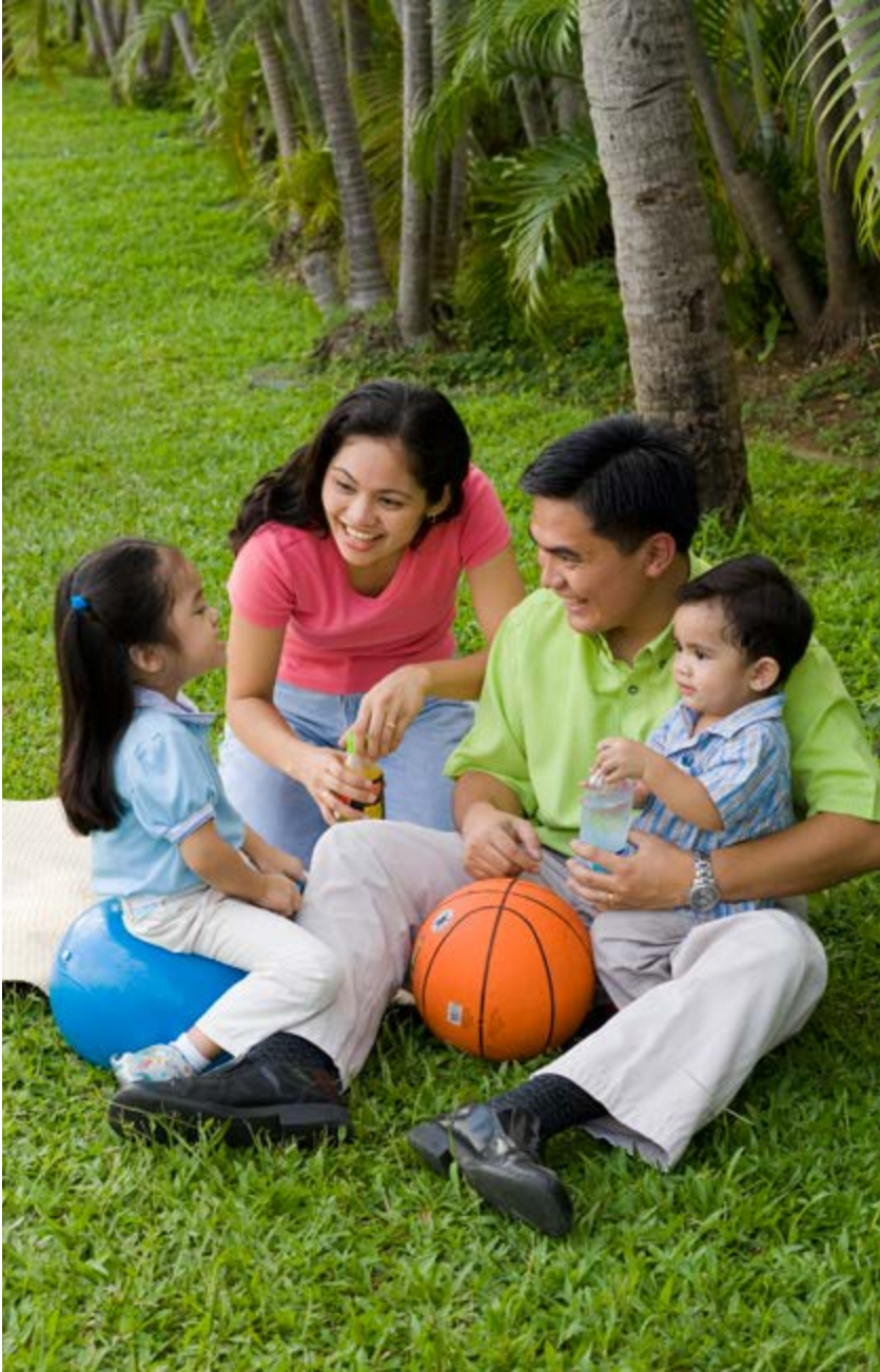
The family “transcends every other interest in life.”