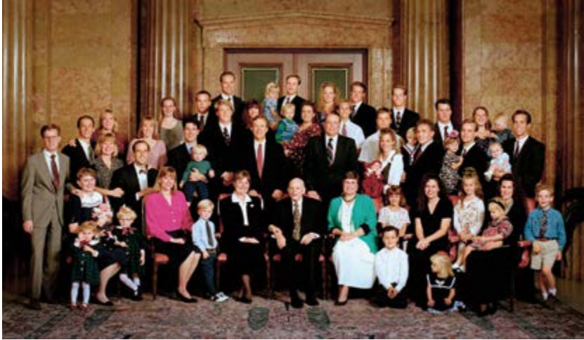
President Hunter with his sons, grandchildren, and their families on October 2, 1994, the day after he was sustained as President of the Church

they define the family as the Lord has revealed it to be. “Except the Lord build the house, they labour in vain that build it” (Ps. 127:1). 6