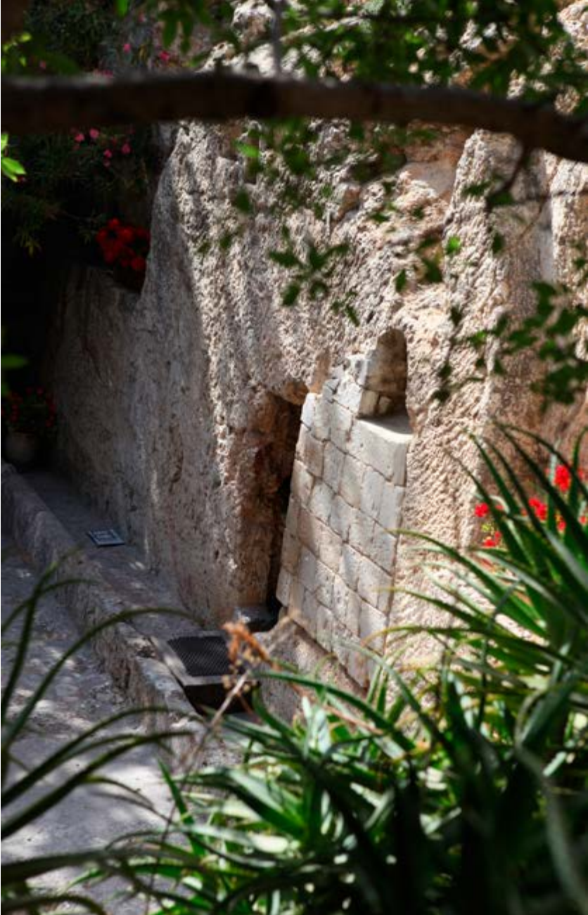
The Savior's empty tomb "proclaims to all the world, 'He is not here, but is risen'" (Luke 24:6).