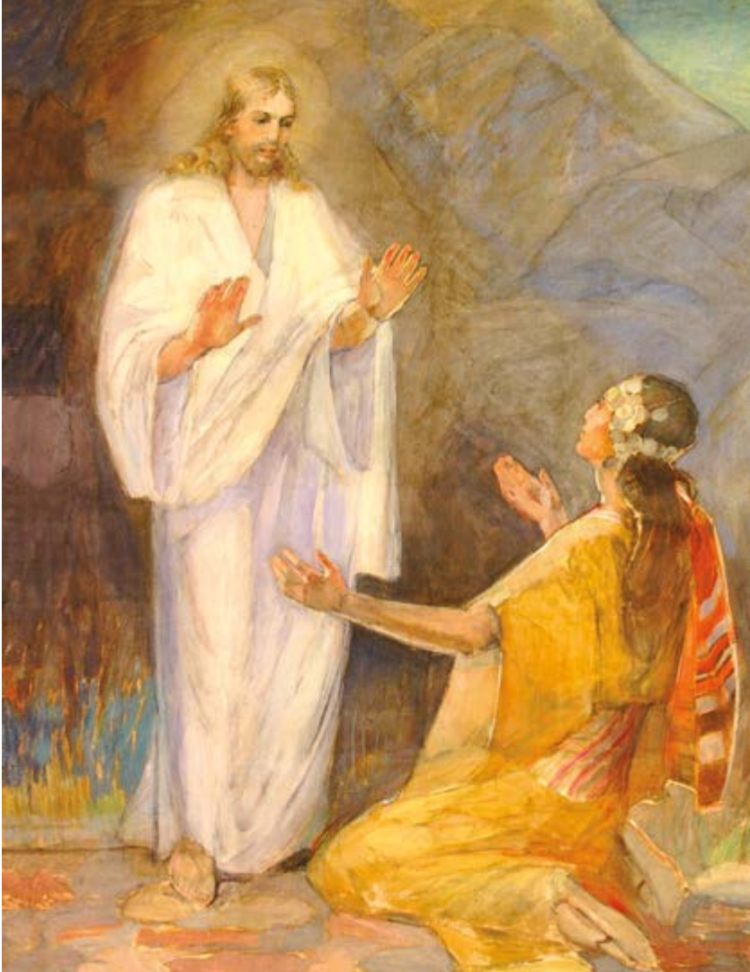
Jesus Christ appeared to Mary Magdalene shortly after He was resurrected (see John 20:1–18).

and we would shudder at the alternative we would have faced had we not received this divine gift. Jacob wrote: