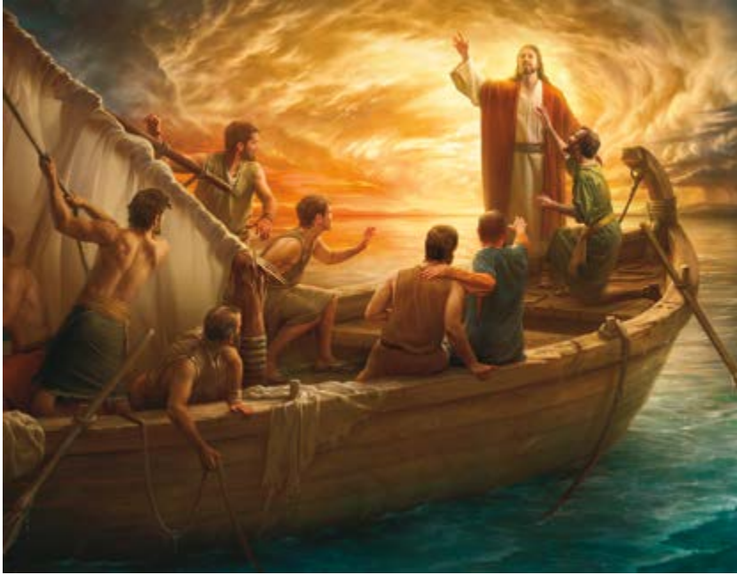
The Savior can calm the storms in our lives.

something each of us should seek. As we come to understand his mission, and the atonement which he wrought, we will desire to live more like him. 9