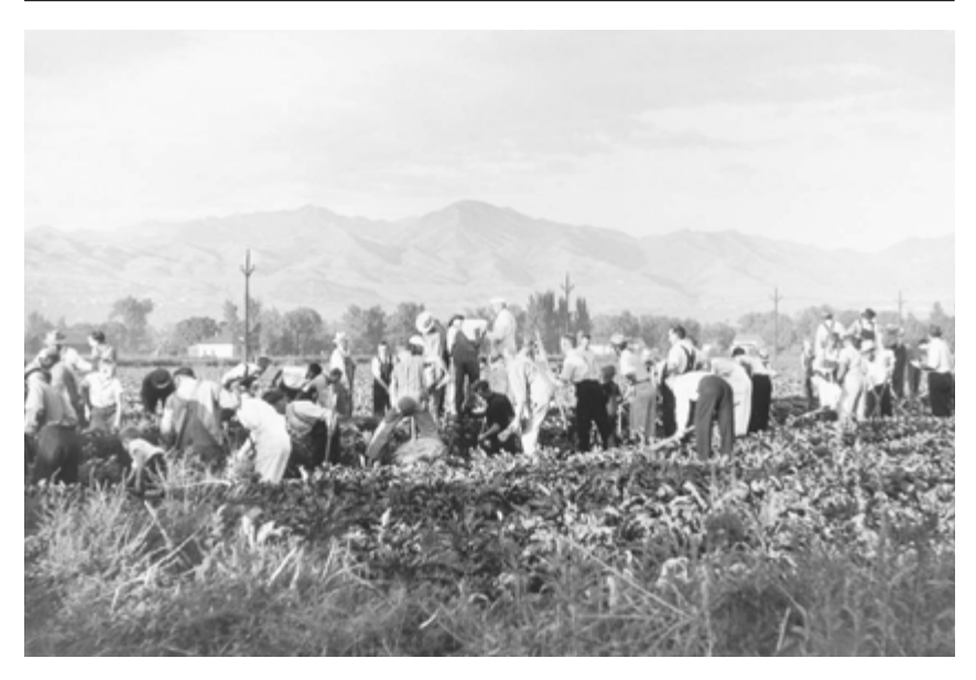
The Church established welfare farms to help provide food for the needy. Church members contributed their labor, as illustrated by these Saints working on a sugar beet farm in 1933.

many hours practicing his penmanship. He became well known for his ability to write beautifully, eventually taught penmanship at a university, and was often called on to write important documents. He was a great example to many people who saw his determination to do the best he could in serving the Lord and his fellowmen.