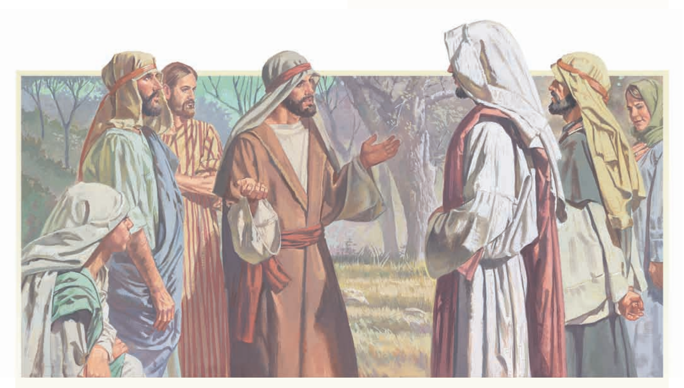
The disciples answered that some people thought Jesus was John the Baptist. Others thought He was