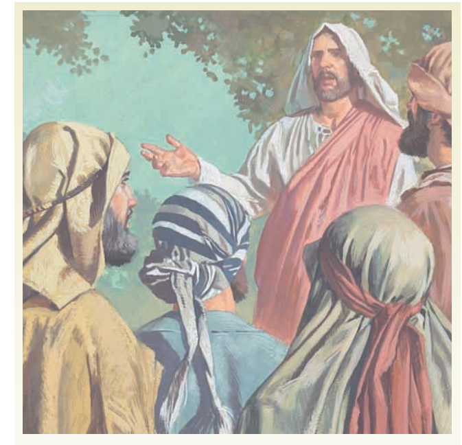
Tesus asked His disciples who the people thought He was.