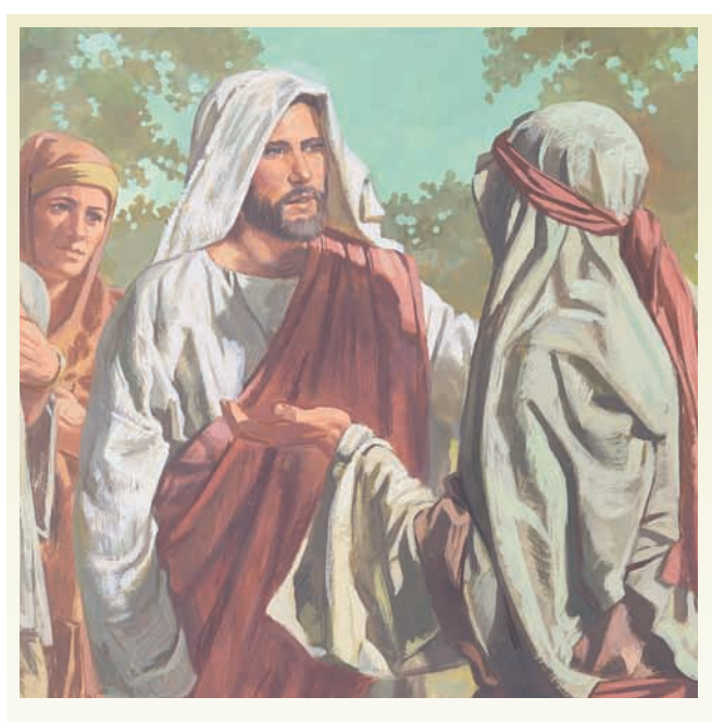
Jesus explained that Peter's testimony had not come from the learning of men. His testimony had come by revelation from God.