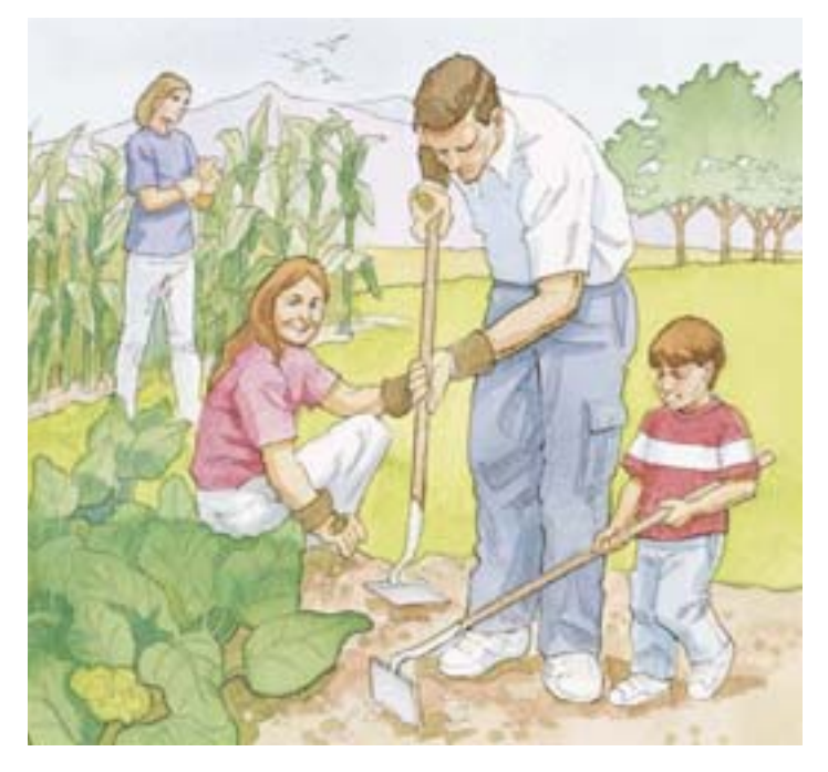
As Church members follow the prophets, they become better, happier people. They have stronger homes and families. They share the gospel with others. They help their neighbors and others in need.