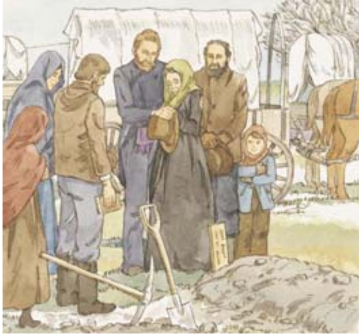
The months the pioneers spent at Winter Quarters were very difficult. They suffered greatly from disease, hunger, and cold, and more than 700 of them died. Despite their trials, they remained strong in their faith and worked hard to get ready for their journey.