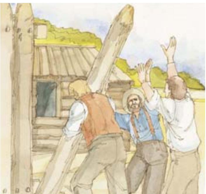
Brigham Young divided Winter Quarters into wards and chose men to be bishops to watch over the members of each ward. The pioneers built a fence around the town for protection.

Some Indians agreed to let the Saints use some land across the river from Council Bluffs. In September the Saints began building a town there, which they called Winter Quarters (see the map on page 190). They planted crops and built over 700 homes.