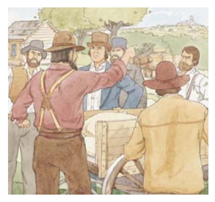
Most of the people who lived near Nauvoo were not members of the Church. Many of them did not like the Saints and began to make trouble for them.