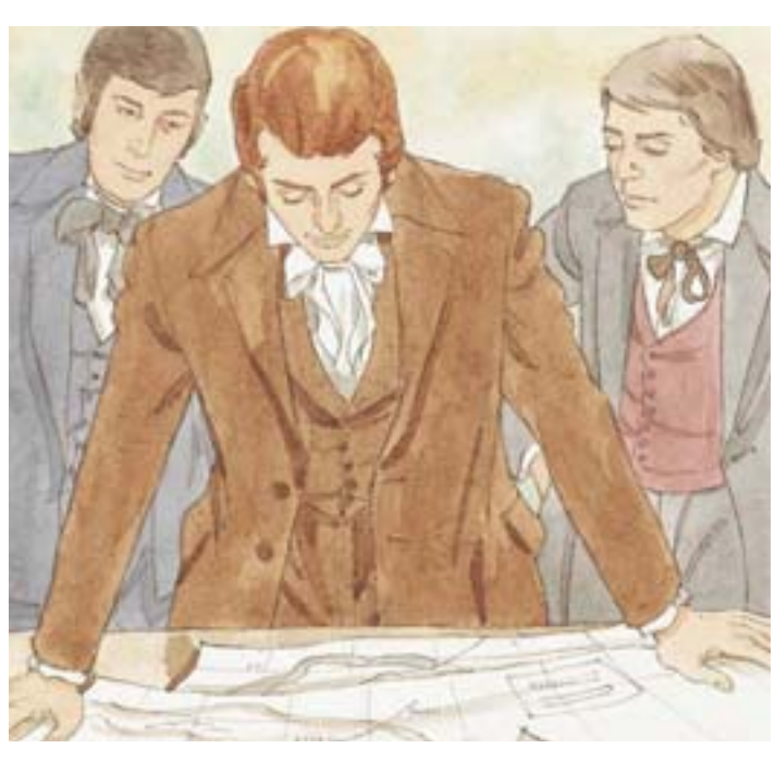
Joseph looked at maps of the land. The maps showed a place where there were tall mountains and wide valleys. Joseph knew this would be a good place for the Saints.