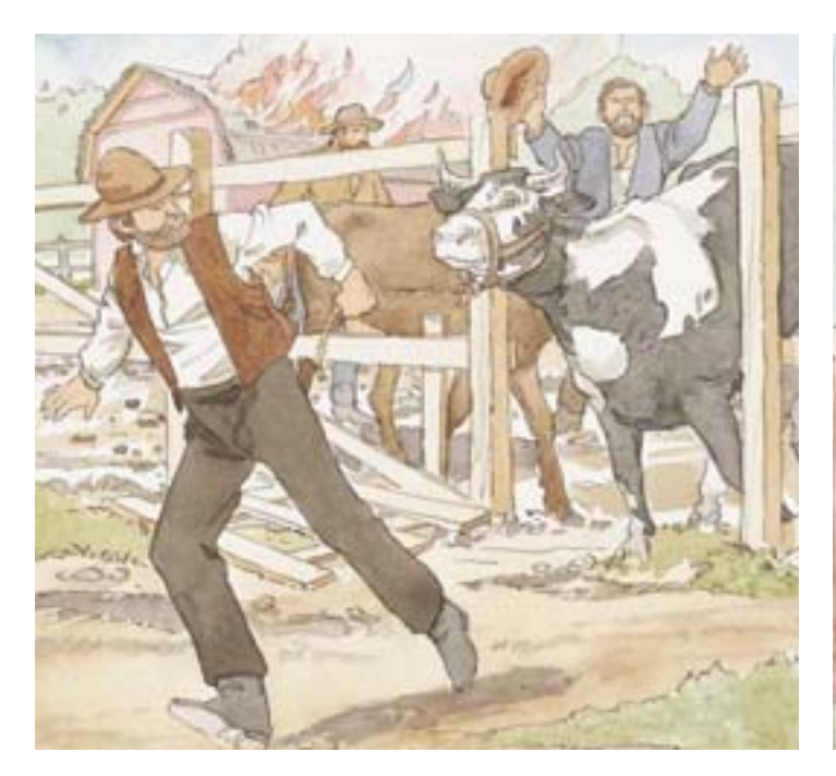
Some of the people gathered together in mobs. They stole the Saints' animals and burned their barns and homes. They tried to get the Saints to leave Nauvoo. The police and the soldiers would not stop the mobs. The governor would not help the Saints.