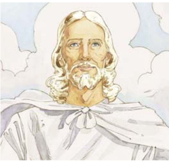
Jesus said He would come to the temple. There He would give revelations about the priesthood. He would also restore ordinances and reveal more knowledge.