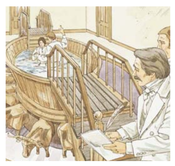
Jesus told Joseph that the Saints could be baptized for people who had died. Jesus said the Saints should build a baptismal font in the temple where they could be baptized for the dead.