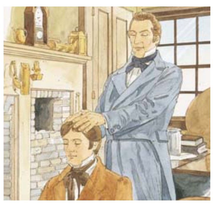
Jesus also revealed that Hyrum Smith, Joseph's brother, should be the patriarch of the Church. As patriarch, Hyrum would give special blessings to Church members.