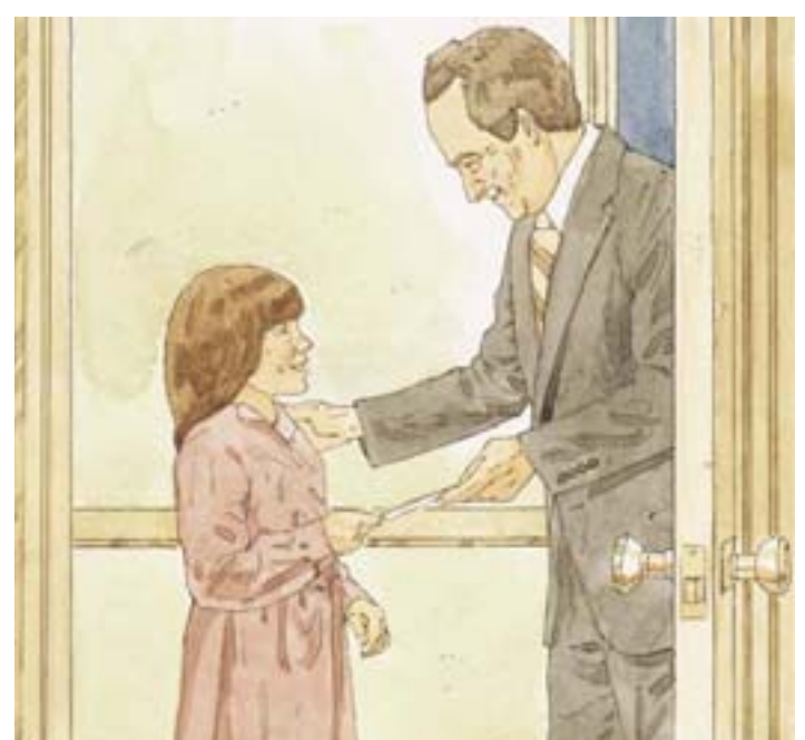
The Lord expects each of us to pay a full tithing. We give our tithing to the bishop. He sends it to the main offices of the Church, where the prophet and other Church leaders prayerfully decide how it should be used.