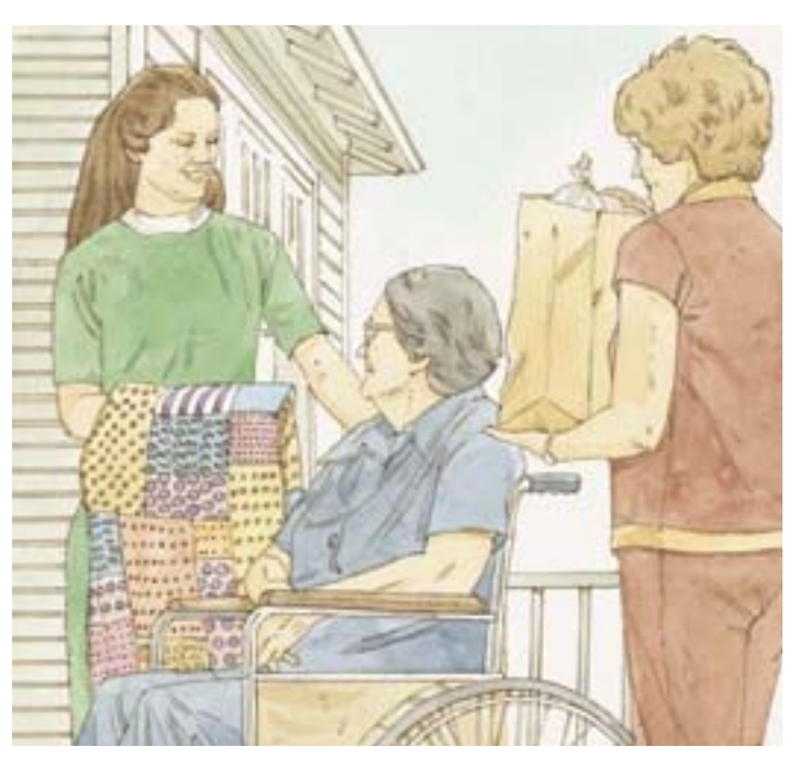
Tithing is used to help members of the Church. Tithing and other offerings are used to help buy food and clothes for needy people.