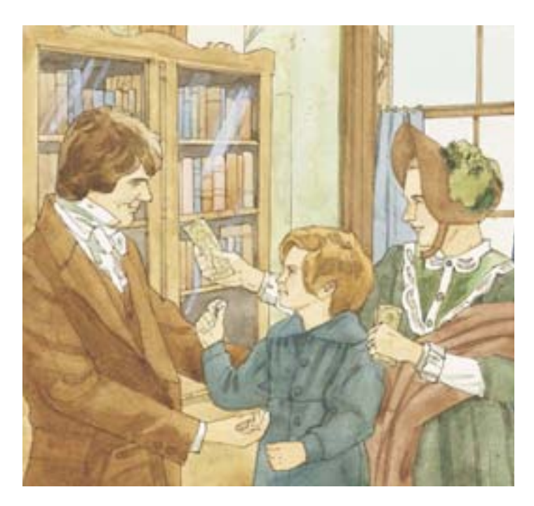
If they earned 10 pennies, they should give one penny for tithing. If they earned 100 pennies, they should give 10 pennies.

Doctrine and Covenants 119, section heading Doctrine and Covenants 64:23; 119:3–4