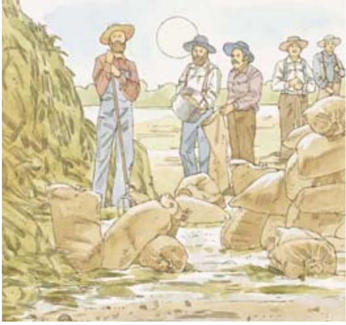
The Saints paid tithing in other ways too. They gave one-tenth of the crops they grew, such as grain and hay. They also gave one-tenth of their chickens and other animals. They also paid tithing on milk and vegetables.