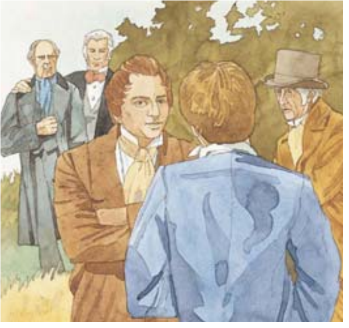
Other men were chosen to lead the Church in Far West. Soon the Church began to prosper again in the area.