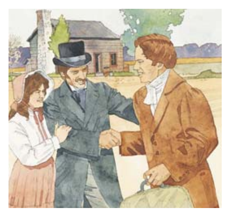
Joseph traveled nearly 1,000 miles to Far West, Missouri. The Saints in Missouri were building this town after being forced to leave other parts of the state. They were happy to see the Prophet.