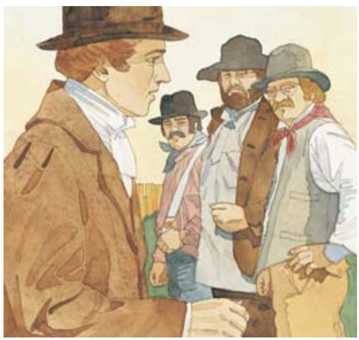
Another time Joseph's enemies did not recognize him when they passed him on the street.