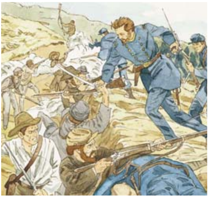
Jesus said the people in the United States would fight against each other in a war. This prophecy was fulfilled when the American Civil War started about 30 years later.