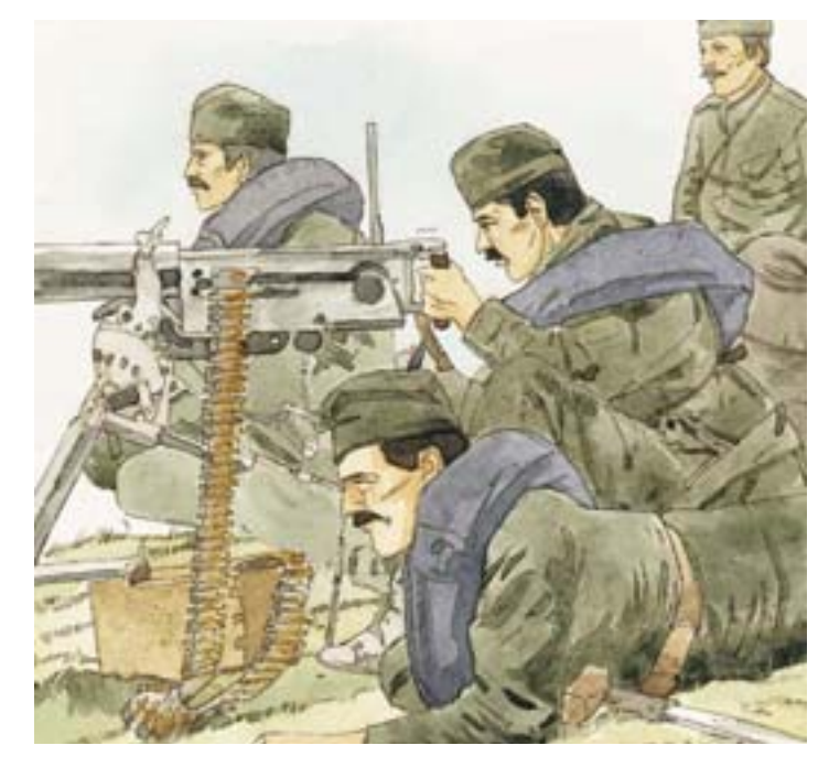
Jesus also revealed that there would be wars in all other parts of the world. Many people would die, and there would be terrible sadness. Jesus said the Saints should be faithful during these hard times.