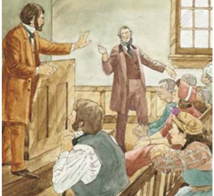
Sad things were also happening in the United States. Some people didn't want to be part of the country. They wanted to have their own leaders.