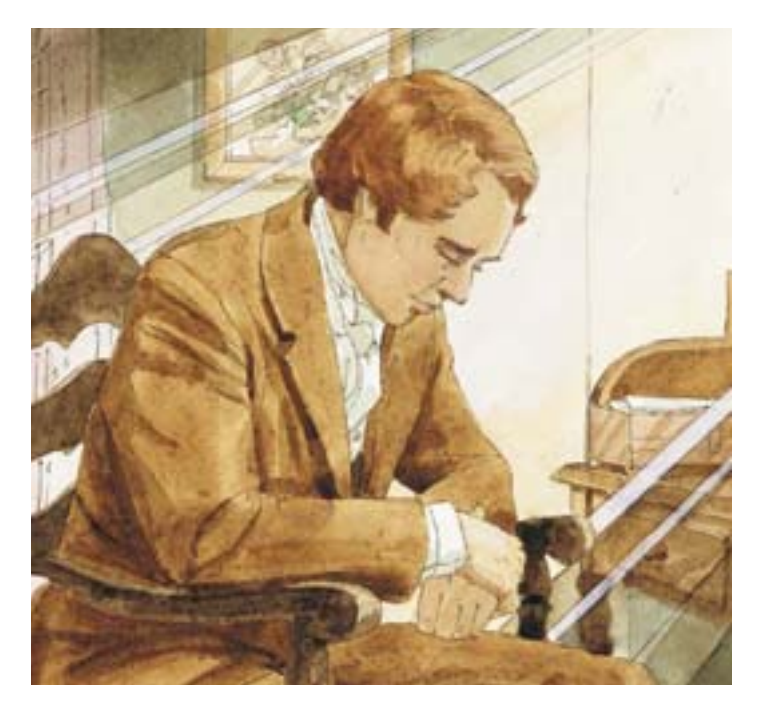
On Christmas Day 1832, Jesus gave Joseph Smith a revelation about war. Doctrine and Covenants 87