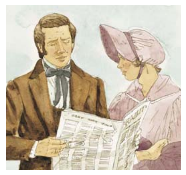
Many people were being baptized into the Church. The gospel made them happy, but they were worried about things that were happening in the world.