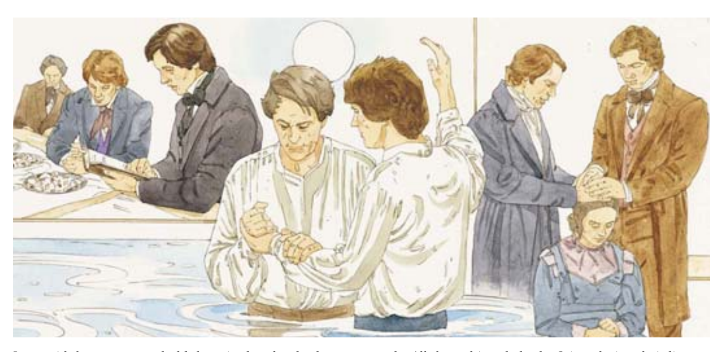
Jesus said that men must hold the priesthood to lead His Church. Men who hold the priesthood can baptize people and give them the gift of the Holy Ghost. They can bless the sacrament. They can give blessings to sick