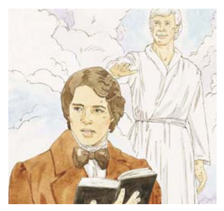
Jesus said missionaries will be blessed if they work hard. Angels will help them, and Heavenly Father will give them what they need.