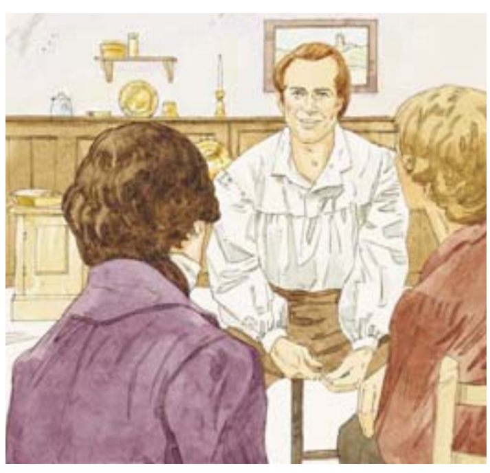
The revelation ended. Joseph and the missionaries were happy to know more about the priesthood. They wanted to use the priesthood the right way.