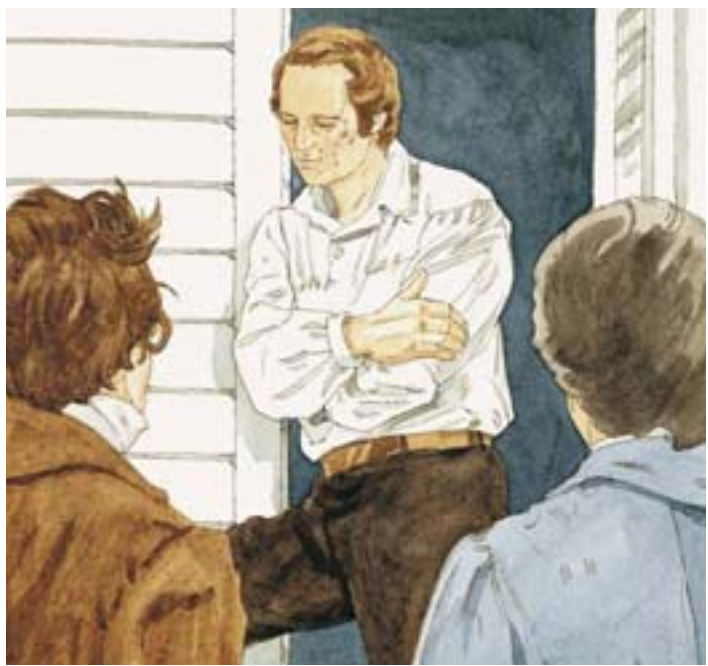
All these missionaries had the priesthood. The priesthood is the power of God. The missionaries wanted to know more about the priesthood.

Doctrine and Covenants 84, section heading