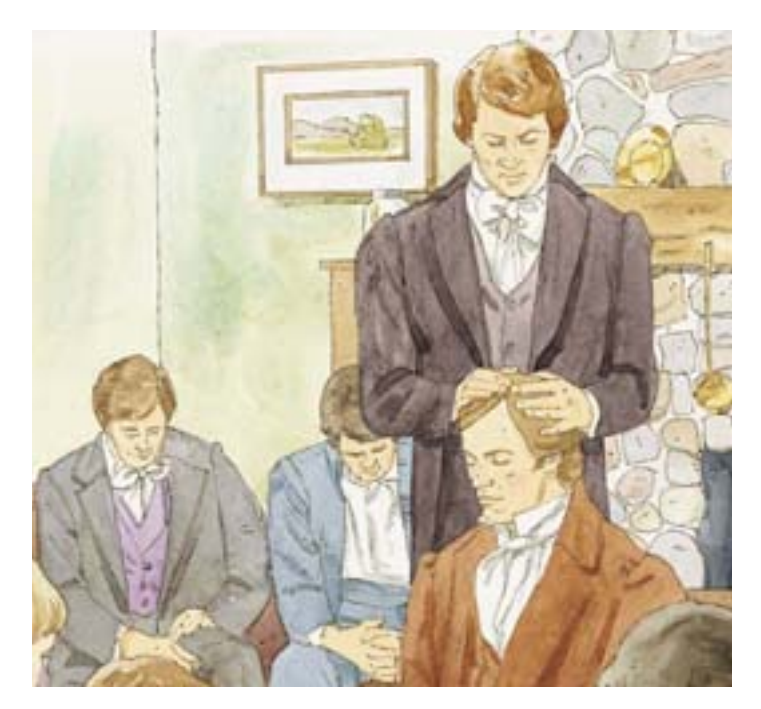
In a later revelation, Jesus told Joseph how men should use the priesthood. Men should never use the priesthood to be bossy or mean. God will give priesthood power only to men who are righteous.