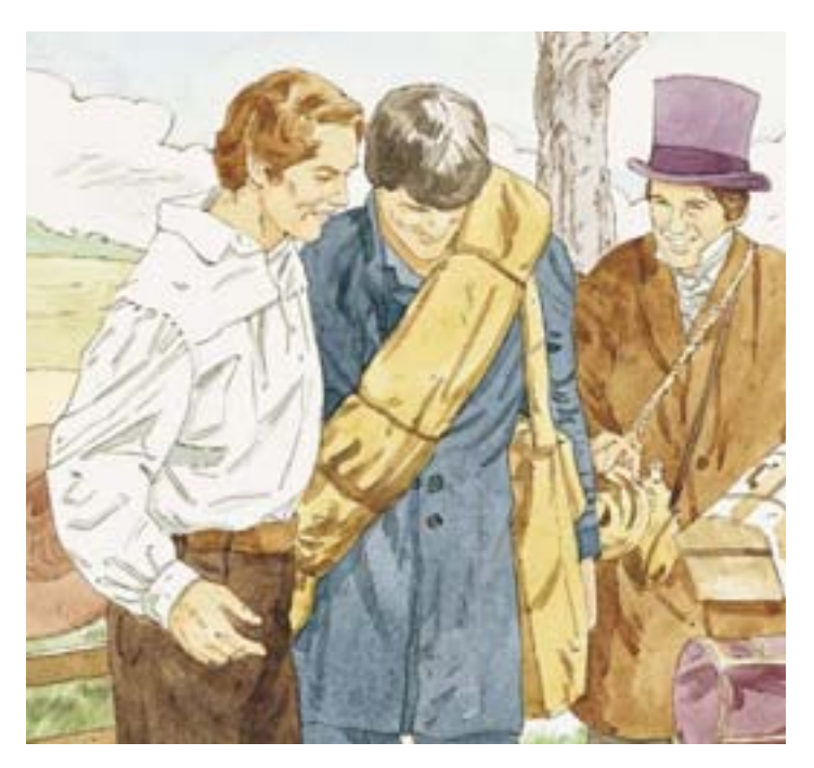
The men told Joseph about their missions. They had baptized many people. They were happy about their missions, and Joseph was happy too.

Doctrine and Covenants 84, section heading