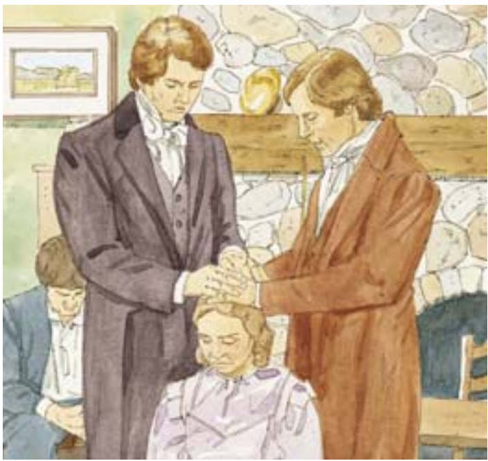
Men should use the priesthood with love and kindness. Those who listen to the Holy Ghost will always have priesthood power.