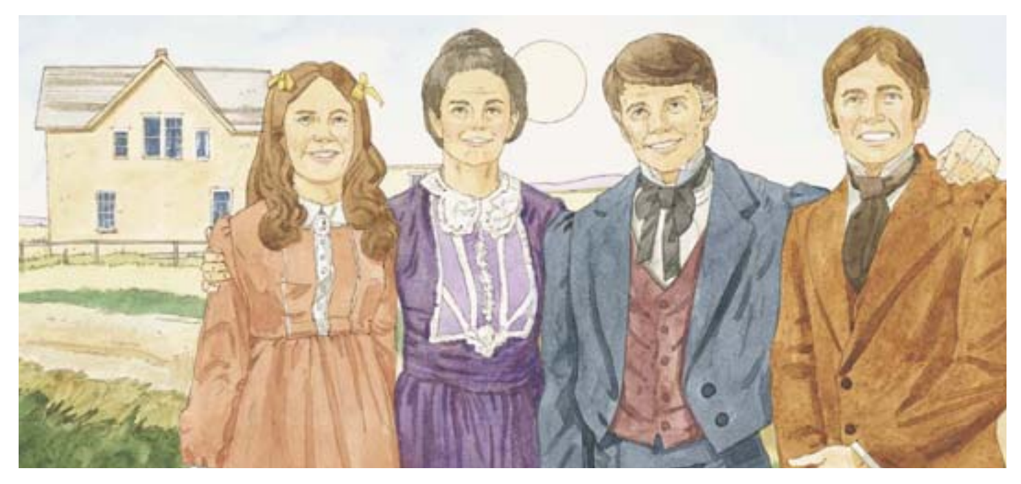
Parents and children who follow Jesus' teachings can have lasting happiness as a family.