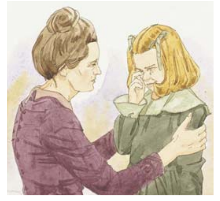
Parents should teach their children how to repent. Doctrine and Covenants 68:25

Parents should teach their children about Jesus and help them develop faith in Him. Doctrine and Covenants 68:25