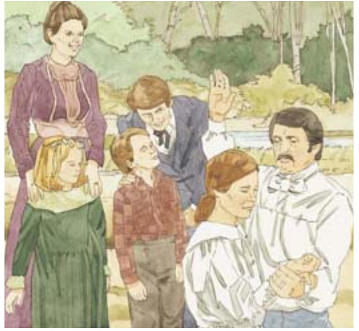
Jesus said children should be baptized when they are eight years old. Parents are to teach their children the gospel before they are baptized.