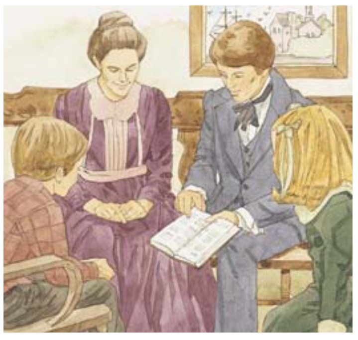
Parents should teach their children to know and obey God's commandments and to be good members of the Church.