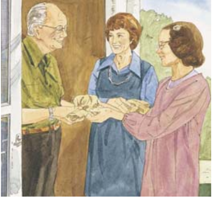
The Doctrine and Covenants teaches the Saints to share. Those who share will be filled with the Holy Ghost.