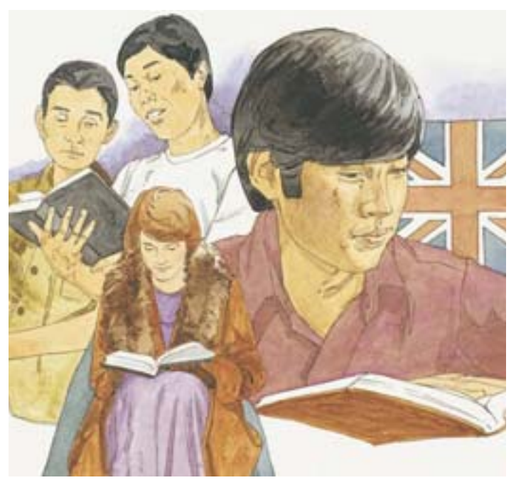
Jesus said all members of the Church should read the Doctrine and Covenants. Doctrine and Covenants 1:37