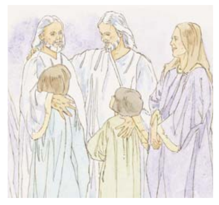
The Doctrine and Covenants teaches the commandments of God. Saints who obey these commandments can live with Heavenly Father and Jesus forever.