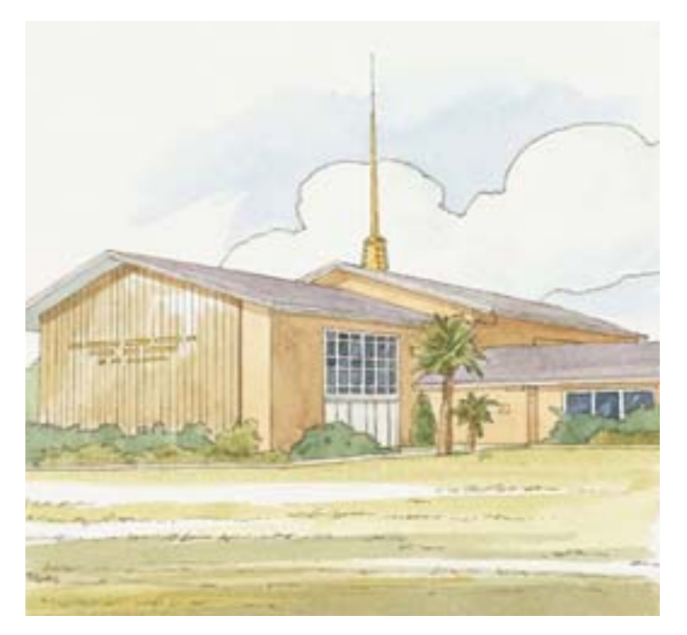
The Doctrine and Covenants tells everyone that the true Church of Jesus Christ is on the earth again.