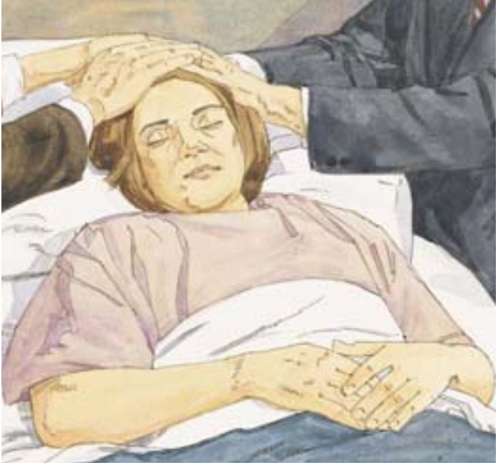
The Doctrine and Covenants tells about the priesthood. It also tells men how to use this power.