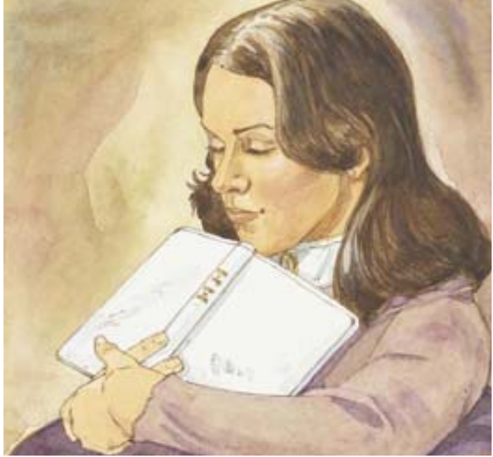
The Doctrine and Covenants was finally published in 1835. The Saints thanked Heavenly Father for the revelations in the Doctrine and Covenants.