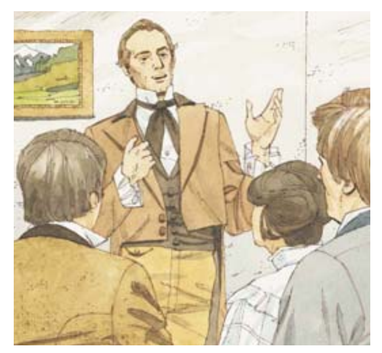
Oliver Cowdery taught the gospel of Jesus Christ. Some of the people believed Oliver and wanted to join the Church. They were baptized after the meeting.