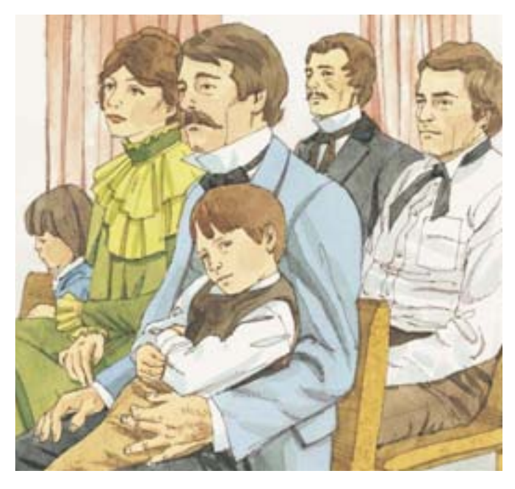
The next meeting of the Church was on Sunday, 11 April 1830. Besides members of the Church, many other people attended the meeting.