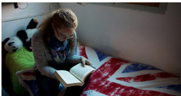
Remembering the Lord can help us feel gratitude in all life’s circumstances.

How do you keep the Lord and His words in your heart—“lest thou forget the Lord”? (Deuteronomy 6:12). How does remembering the Lord help us feel gratitude in all the circumstances of our lives? As you prepare to teach, consider reviewing Deuteronomy 12:6–9, 12 and Luke 17:11–19. You could also review President Dieter F. Uchtdorf’s message “Grateful in Any Circumstances” ( Ensign or Liahona , May 2014, 70–77).