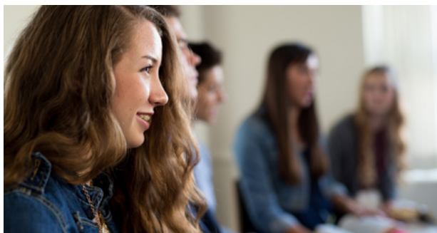
We can make the things of God our highest priority.