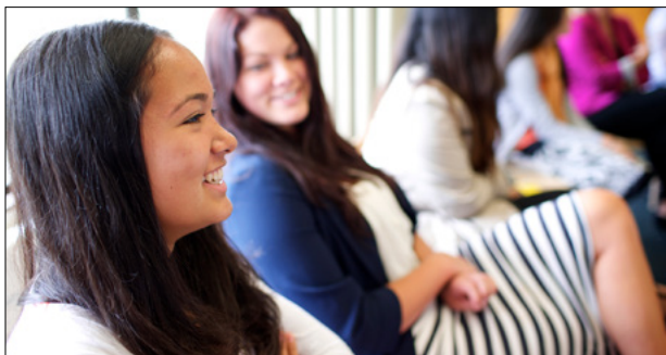
Because of Jesus Christ, our burdens of sin can be taken away.