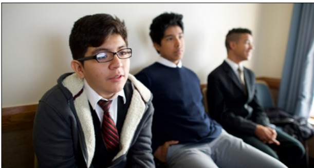
To remain faithful to God's law of chastity, we should strive each day to keep our thoughts, words, and actions pure.

You can prepare to teach by reading 2 Samuel 11, Elder David A. Bednar's message "We Believe in Being Chaste" ( Ensign or Liahona , May 2013, 41–44), and other resources about chastity. What might inspire class or quorum members to see chastity the way God sees it? What might help them reject the way Satan sees it?