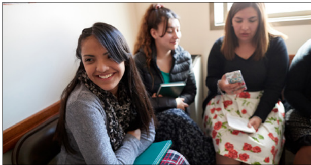
By focusing on our faith in Jesus Christ, we can find strength in our adversities.