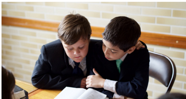
The Lord has promised that in the last days, He will pour out His Spirit, and “your sons and your daughters shall prophesy” (Joel 2:28).

So when you notice the darkness and gloominess of our time, remember that the Lord has also promised great—even unimaginable—blessings: “I will pour out my spirit upon all flesh; and your sons and your daughters shall prophesy” (Joel 2:28; see also Joseph Smith—History 1:41). Note the specific promise that God's Spirit would be poured out upon young men and young women. Why do you feel it is important for those you teach to understand that? Ponder this question as you read Joel 2 and Elder Uchtdorf's message in your preparation to teach.