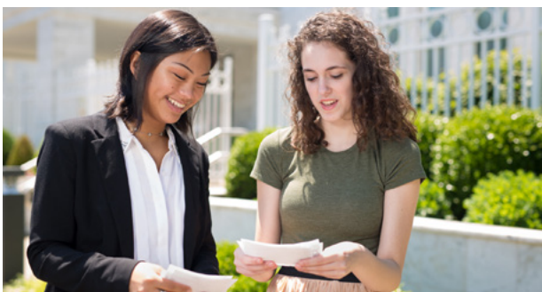
Each young person is uniquely able to contribute to the work of salvation and exaltation.

Even though we all covenant to serve God when we are baptized, not all young people see themselves as the Lord's servants. They may not recognize the unique ways they can help with His work. Look for passages in Isaiah 41–44 and section 1.2 of the General Handbook: Serving in The Church of Jesus Christ of Latter-day Saints that could help the youth understand what it means to be the Lord's servants.