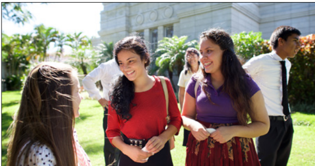
Our lives can be changed when we understand our true identity as children of God.

We all need experiences that help us replace our self-doubts with God's understanding of who we are and who we can become. Young people, in particular, are confronted with false messages about their personal worth. And as with Moses, God "has a work for [them] to do" (Aaronic Priesthood Quorum Theme). They have their own Pharaohs to confront and their own people to rescue. How will you help them remember that they are beloved daughters and sons of heavenly parents "with a divine nature and eternal destiny"? (Young Women Theme). Ponder this as you read Exodus 1–6. Consider also studying Doctrine and Covenants 18:10–15 and President Dieter F. Uchtdorf's message "You Matter to Him" ( Ensign or Liahona , Nov. 2011, 19–22).