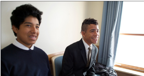
True joy comes from exercising faith in the Savior, even during hard times.

Think of some of the challenges that members of your class or quorum may be facing. How will you help them understand that true joy comes from exercising faith in the Savior—even during hard times? Ponder this question as you prepare to teach. Look for related passages you can share with your class or quorum in the Psalms or in President Nelson’s message “Joy and Spiritual Survival.”