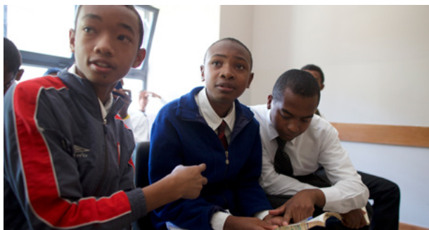
In class and quorum meetings, we make plans to fulfill our roles as part of the Lord's youth battalion.

Young Women class and Aaronic Priesthood quorum meetings are different from Church classes like Sunday School or seminary. In class or quorum meetings, we do more than study a gospel topic. We learn about the work God has given us, and we organize the members of our class or quorum to do that work in our homes, in the Church, and in our communities. In these meetings, we don't just talk about the work—we make plans to fulfill our roles as part of the Lord's youth battalion, including helping to gather Israel.