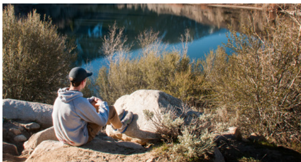
Disciples of Jesus Christ can find peace as they live faithfully despite opposition.

How can you help class or quorum members remain faithful when they feel like "strangers and pilgrims" in the world because they live the Lord's standards? How can you inspire them to be courageous as they live true to the Lord? As you prepare to teach, consider reviewing John 15:18–20 and Elder Neil L. Andersen's message "Overcoming the World" ( Ensign or Liahona , May 2017, 58–62).