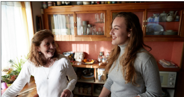
We can follow the Savior's example as we serve as part of our daily lives.

As you prepare to teach about the help we can receive from the Lord as we serve others, review Moses 6 and think of experiences you have had serving others. How did the Lord help you in your efforts? What do you hope your class or quorum members will learn from the examples of Enoch and others? You could also read one of these messages by President Henry B. Eyring: "Walk with Me" ( Ensign or Liahona , May 2017, 82–85) or "Covenant Women in Partnership with God" ( Ensign or Liahona , Nov. 2019, 70–73).