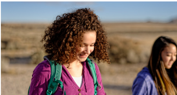
Our bodies have been created in the image of God.

God has given us, His children, a responsibility to care for all that He has created. President Russell M. Nelson taught: “As beneficiaries of the divine Creation, what shall we do? We should care for the earth, be wise stewards over it, and preserve it for future generations. . . . We are to prepare for our own divine destiny—glory, immortality, and eternal lives” (“The Creation,” Ensign , May 2000, 86). How will you help class or quorum members increase their desire to care for and protect their bodies and all of God’s creations? To prepare to teach, you could review President Nelson’s message cited above and Doctrine and Covenants 59:15–20; 104:13–18.