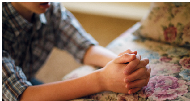
We are forgiven as we accept the mercy offered by Jesus Christ.