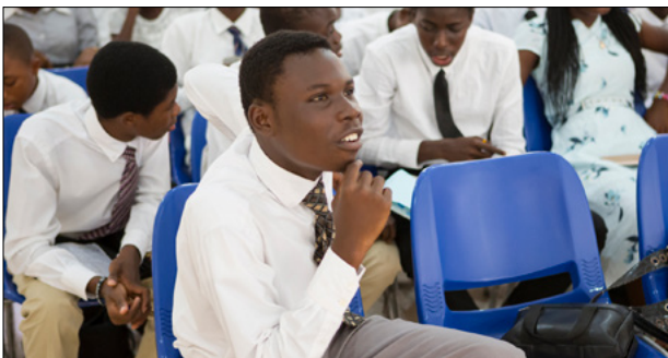
The Savior will help and comfort us in our trials.

Think about the blessings that will come to members of your class or quorum as they more fully understand how the Savior can help them in their trials. How has the Savior helped you? As you prepare to teach, you might review President Henry B. Eyring’s message “Tested, Proved, and Polished” ( Ensign or Liahona , Nov. 2020, 96–99) and “Adversity” in Gospel Topics ( topics.ChurchofJesusChrist.org ).