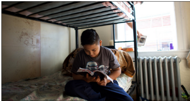
President Russell M. Nelson has asked us to “increase [our] spiritual capacity to receive revelation.”

In addition to reading 1 Samuel 3 this week, you can prepare to teach by reading President Russell M. Nelson’s message “Hear Him” ( Ensign or Liahona , May 2020, 88–92).