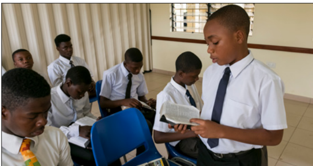
Following the prophet can help young people with the challenges they face.