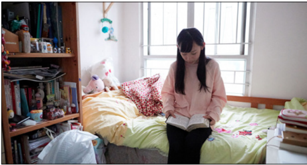
As we learn more about the Savior, we are inspired to make Him the center of our lives.