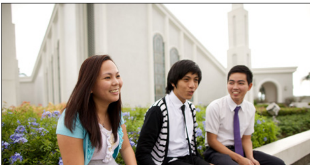
Temple ordinances help us become like God and receive all that He has.

How will you help the youth long for the temple as the Israelites did? How will you help them desire with all their hearts to make covenants with God in His holy house? As you prepare to teach, consider reviewing President Thomas S. Monson’s message “Blessings of the Temple” ( Ensign or Liahona , May 2015, 91–93) and the article “Why Ordinances and Covenants Matter” at temples.ChurchofJesusChrist.org .