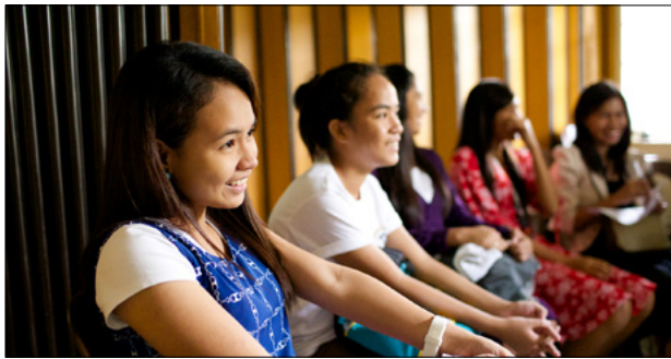
We can strengthen our faith each day in small and simple ways.

the Red Sea, and also for life-sustaining miracles, like manna from heaven. The same is true for those you are teaching. If they are to survive their spiritual journey in the wilderness of mortality, they must exercise faith in Jesus Christ. And they must exercise that faith each day, not just occasionally. Some of those you teach may not feel that their faith is particularly strong. You can help them see that faith grows gradually, day by day. It is nourished through small and simple things that we do consistently. Ponder these things as you study Exodus 14–17 this week. You might also study President Dallin H. Oaks’s message “Small and Simple Things” ( Ensign or Liahona , May 2018, 89–92).