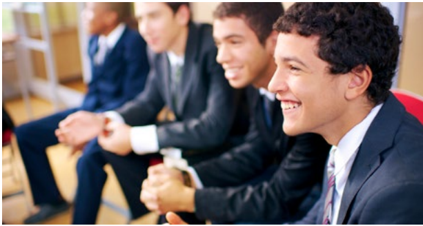
Quorum and class members can strengthen each other in resisting pornography.

As you prepare to teach, consider reviewing “Entertainment and Media” and “Sexual Purity” in For the Strength of Youth ([2011], 11–13, 35–37) and Let Virtue Garnish Thy Thoughts (booklet, 2006).