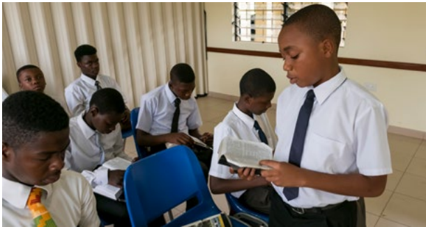
The scriptures help us understand how the priesthood blesses our lives.

you could share. To prepare yourself to teach about the priesthood, consider studying the scriptures suggested in this week's outline in Come, Follow Me—For Individuals and Families and “Priesthood” in Guide to the Scriptures (scriptures.ChurchofJesusChrist.org).