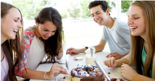
Young men and young women can learn to work together in building God’s kingdom.