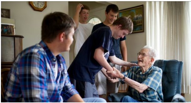
Caring for those in need is part of the work of salvation.

To prepare yourself to lead quorum or class members in this study, you could read and ponder one or more of the messages found in “Supporting Resources.”