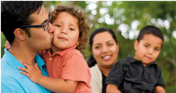
Families can be sealed eternally through the ordinances of the temple.

How can you help members of your quorum or class feel a greater desire to be sealed in the temple? To prepare yourself to teach about temple marriage, you might explore the article “About a Temple Sealing” at temples.ChurchofJesusChrist.org or read “Marriage” in True to the Faith ([2004], 97–101).