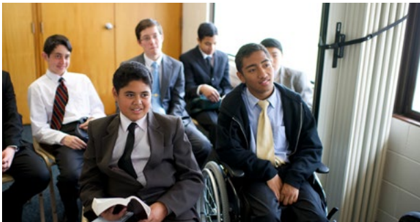
Learning about the plan of salvation gives direction and purpose to our lives.

How has knowing about Heavenly Father’s plan influenced your perspective on life? How can you help your quorum or class understand what a blessing it is to know about the plan of salvation? To prepare to teach, you could read “Plan of Salvation” in True to the Faith ([2004], 115–17) or Elder Dieter F. Uchtdorf’s message “Your Great Adventure” ( Ensign or Liahona , Nov. 2019, 86–90).