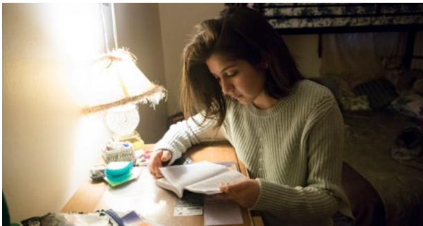
The examples of God's faithful servants in the past can inspire us to live faithfully today.