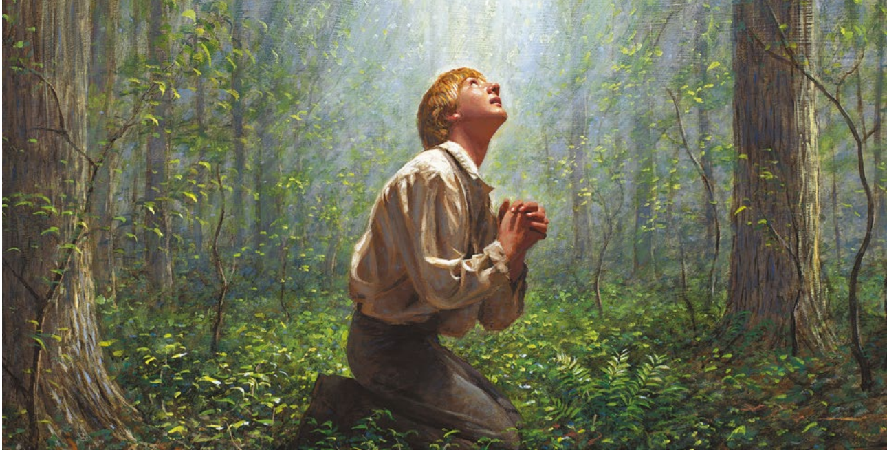
150w x 100h, by Jon McNaughton