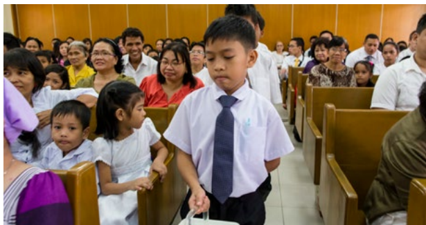
Great spiritual blessings are available to us through priesthood keys.