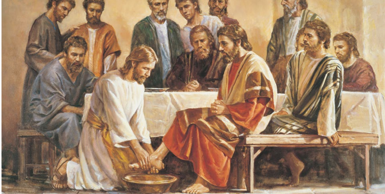
Jesus Washing the Apostles' Feet by Del Parson