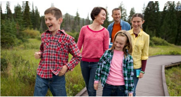
The family is central to Heavenly Father’s plan for us.