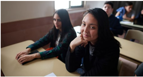
To receive the guidance of the Holy Ghost, we should seek His influence daily.

To help you prepare to teach, you could review “The Gift of the Holy Ghost” in True to the Faith ([2004], 83–84) or President Henry B. Eyring’s message “His Spirit to Be with You” ( Ensign or Liahona , May 2018, 86–89).