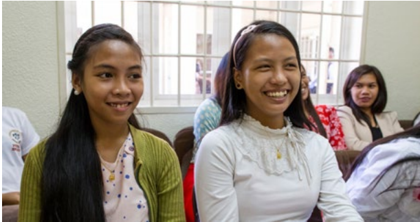
Each young person can receive a personal testimony of the First Vision.

the Holy Ghost? How will you help them do this? It may be helpful for you to review the messages from the April 2020 general conference, which commemorated the 200th anniversary of this glorious vision.