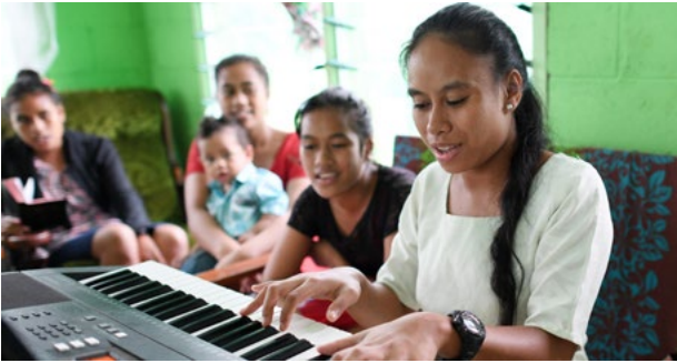
We can feel greater love in our families as we center our homes on Christ.

What blessings have come to your family because you have followed the Savior’s teachings? How can quorum or class members help their families establish a Christ-centered home? To prepare to teach, you could review President Henry B. Eyring’s message “A Home Where the Spirit of the Lord Dwells” ( Ensign or Liahona , May 2019, 22–25) and “The Family: A Proclamation to the World” ( ChurchofJesusChrist.org ).