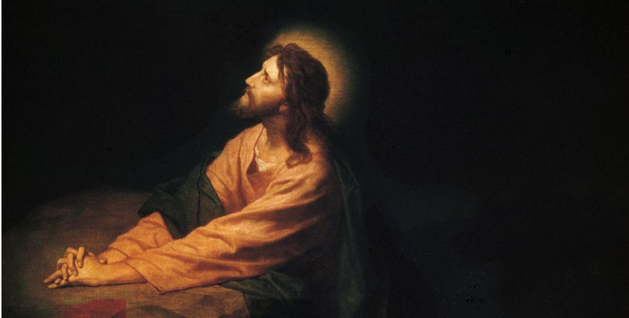
Christ in Gethsemane, by Heinrich Hofmann