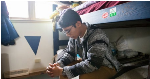
Priesthood power comes through righteous living.

Do the members of your quorum or class know how to access the power of the priesthood? How might their lives and their service be different if they had that understanding? Ponder these questions as you study Doctrine and Covenants 121. It would also be good to study two messages from President Russell M. Nelson. One is addressed to priesthood holders—“The Price of Priesthood Power” ( Ensign or Liahona , May 2016, 66–69). The other is addressed to sisters—“Spiritual Treasures” ( Ensign or Liahona , Nov. 2019, 76–79).