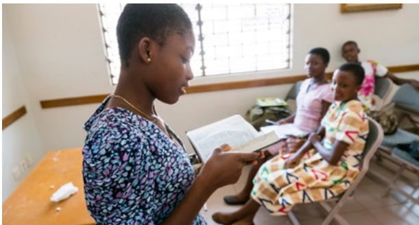
The Holy Ghost can help us understand and teach the truths of the gospel.