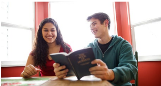
Our lives are blessed by the truths restored through the Prophet Joseph Smith.

As you prepare to teach, in addition to studying Doctrine and Covenants 135, consider reviewing President M. Russell Ballard’s message “Shall We Not Go On in So Great a Cause?” ( Ensign or Liahona , May 2020, 8–11) and Elder Neil L. Andersen’s message “Joseph Smith” ( Ensign or Liahona , Nov. 2014, 28–31).