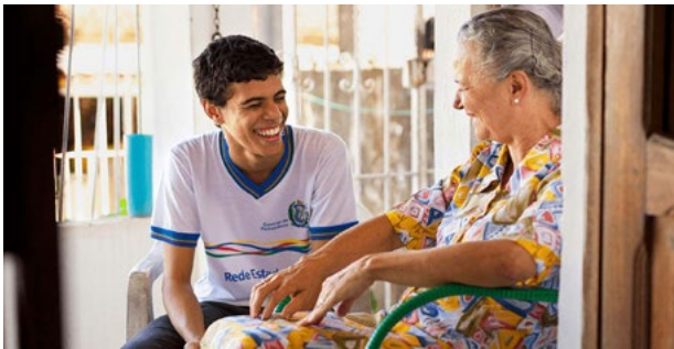
We can serve others as the Savior did.

To help you prepare to teach about Christlike service, you could review “Service” in For the Strength of Youth ([2011], 32–33) and President Russell M. Nelson’s message “The Second Great Commandment” ( Ensign or Liahona , Nov 2019, 96–100).