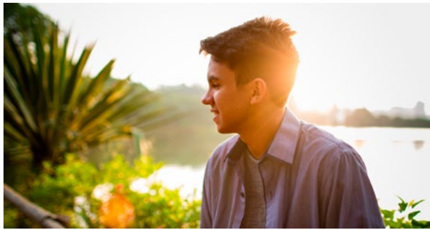
We can find peace in times of adversity by turning to the Savior.

How has turning to the Lord during times of adversity strengthened you and improved your relationship with Jesus Christ? What challenges and trials are members of your quorum or class experiencing, and how can you help them find strength in the Savior? To help you prepare to teach about adversity, you might review Elder Neil L. Andersen’s message “Wounded” ( Ensign or Liahona , Nov. 2018, 83–86) and “Adversity” in True to the Faith ([2004], 8–11).