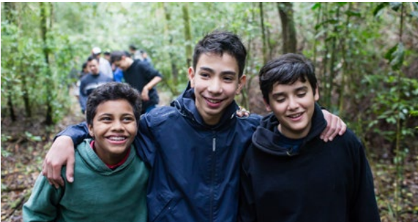
Caring for our physical bodies influences our mental, emotional, and spiritual health.

Members of your quorum or class may have studied the Word of Wisdom as they read Doctrine and Covenants 89–92 this week. How can you help them understand the physical and spiritual blessings that come from obeying this revelation? You can find helpful insights by reviewing the Gospel Topics article “Word of Wisdom” ( topics.ChurchofJesusChrist.org ) or “Physical and Emotional Health” in For the Strength of Youth ([2011], 25–27).