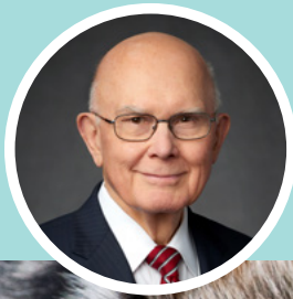
By President Dallin H. Oaks First Counselor in the First Presidency