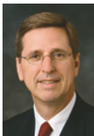
By Elder Kevin W. Pearson Of the First Quorum of the Seventy

You might think you don't have a testimony, but in fact, you always have.