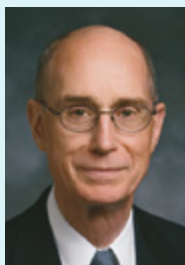
By President Henry B. Eyring First Counselor in the First Presidency