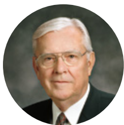
By President M. Russell Ballard Acting President of the Quorum of the Twelve Apostles

The Lord has many wonderful blessings for you as you live your life.