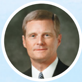
By Elder David A. Bednar Of the Quorum of the Twelve Apostles