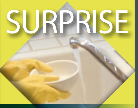
your parents by washing the dishes, vacuuming, or doing other chores even when it's not your turn.

VISIT senior citizens at a nursing home.