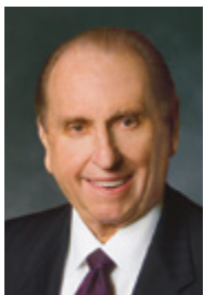
President Thomas S. Monson