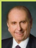
ILLUSTRATION BY BEN SOWARDS