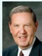
Elder Robert D. Hales of the Quorum of the Twelve Apostles

"To rationalize disobedience does not change spiritual law or its consequences but leads to confusion, instability, wandering in strange paths, being lost, and grief. As disciples of Christ, we have a sacred obligation to uphold His laws and commandments."