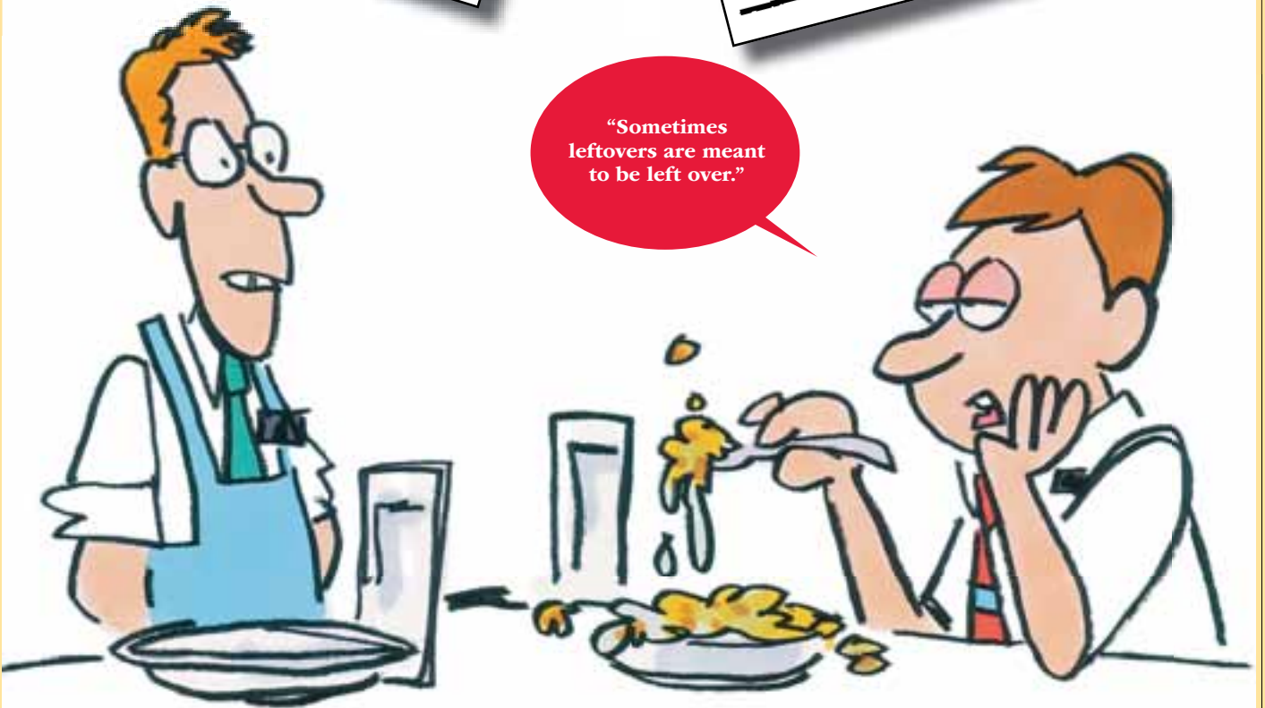
VAL CHADWICK BAGLEY

"Sometimes leftovers are meant to be left over."