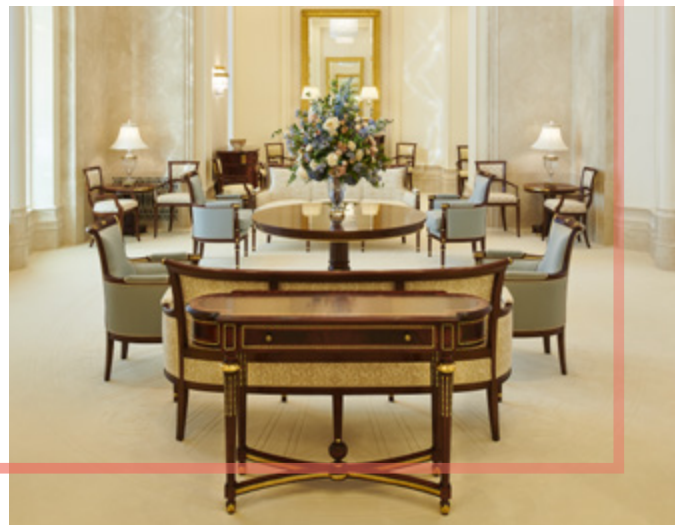
Rome Italy Temple celestial room