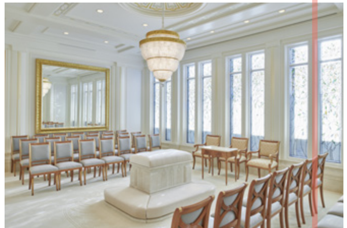
Rome Italy Temple sealing room