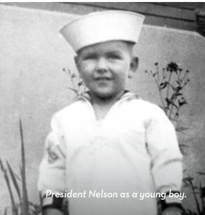
President Nelson as a young boy.

W hen President Russell M. Nelson was young, he liked to keep busy and be independent. He worked at a few different jobs in those years—for instance, in his father’s advertising business, in the post office, in a bank. But as he got older and thought seriously about what he wanted to do with his life, he knew he had to choose his path.