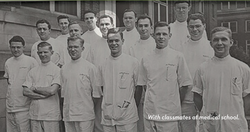
With classmates at medical school.

His chosen career path led him to become a world-renowned heart surgeon and medical researcher. And it all started with his love of others and desire to serve them. In addition, his love of God and desire to serve Him and His children has also led him along his path of Church service, including as an Apostle and now the 17th President of the Church.