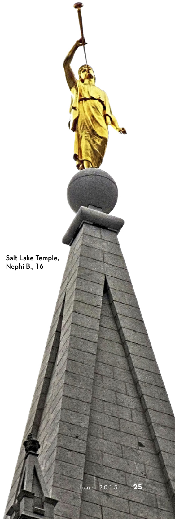
Salt Lake Temple, Nephi B., 16