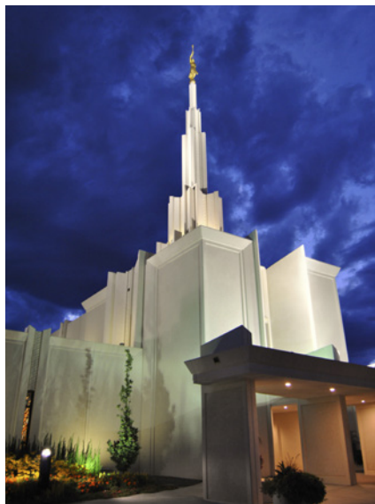
Denver Colorado Temple, Hayden C., 16