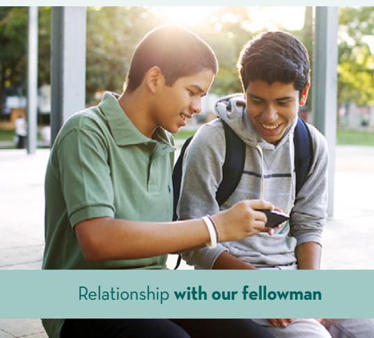
Relationship with our fellowman

“no man cometh unto the Father, but by [Christ]” (John 14:6). To strengthen our relationship with God, we need some meaningful time alone with Him. Quietly focusing on daily personal prayer and scripture study, always aiming to be worthy of a current temple recommend—these will be some wise investments of our time and efforts to draw closer to our Heavenly Father. Let us heed the invitation in Psalms: “Be still, and know that I am God” (Psalm 46:10).