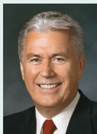
By President Dieter F. Uchtdorf

Second Counselor in the First Presidency