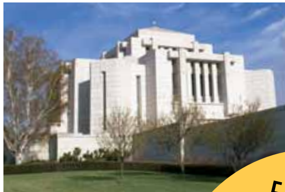
Left: Cardston Alberta Temple.