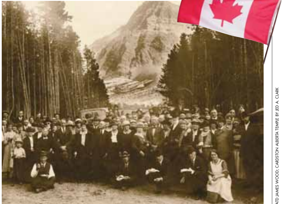
Above: Group portrait of members in Canada featuring President Heber J. Grant.