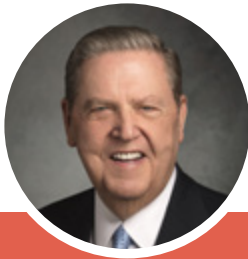
By Elder Jeffrey R. Holland Of the Quorum of the Twelve Apostles