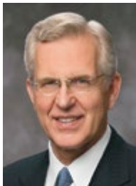
By Elder D. Todd Christofferson

What is it about making and keeping covenants with God that gives us power?