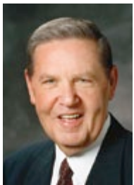
By Elder Jeffrey R. Holland Of the Quorum of the Twelve Apostles