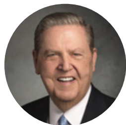
By Elder Jeffrey R. Holland Of the Quorum of the Twelve Apostles

We have a life of devoted discipleship to give in demonstrating our love of the Lord.