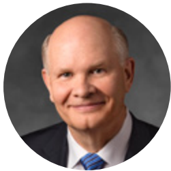
By Elder Dale G. Renlund Of the Quorum of the Twelve Apostles

Because of the restored gospel, you can know who you really are and what God expects you to do.