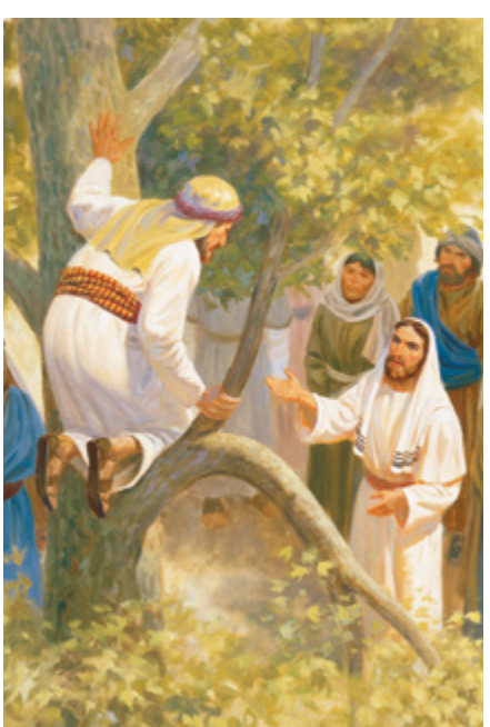
Zacchaeus climbed a tree to see over the crowd as Christ passed through his city.

opinions—sometimes very strong opinions that were the opposite of mine—about everything from movies and politics to the interpretation of certain scriptures. I would look around at all of the nodding heads and think, "You're nice people and I am a nice person. But we are just too different. I don't belong here."