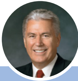
By Elder Dieter F. Uchtdorf Of the Quorum of the Twelve Apostles