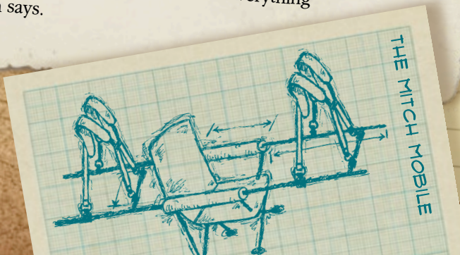
THE MITCH MOBILE

Of course, it was only after the carrier was completed that the true service began. After a few short trial runs around town, it was time to take the Mitch Mobile out on its true maiden voyage.