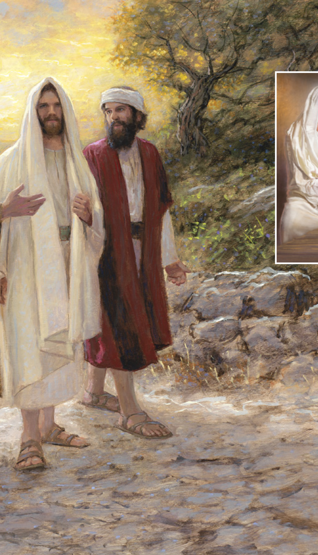
ROAD TO EMMALUS, BY JON MCNAUGHTON