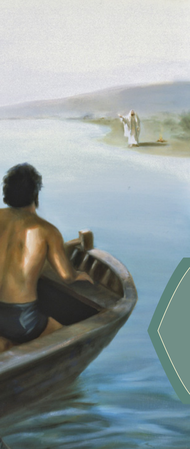
THE RESURRECTED CHRIST AT THE SEA OF TIBERIAS BY DAVID LINDSLEY

During the Crucifixion, land in the Americas was ravaged by earthquakes, fires, other natural disasters, and three days of darkness to mark the Savior’s death. Later, Christ descended from heaven and visited a multitude of 2,500 gathered near the temple at Bountiful. He invited the people to feel the wound marks in His hands and feet and side, offered a sermon, and blessed the children of the Nephites one by one. Even more people gathered the next day, and the Savior visited and taught them. The disciples eventually formed the Church of Christ, and the Nephites received such a powerful witness that they and the Lamanites too became converted unto the Lord. (See 3 Nephi 11–18; see also 3 Nephi 8–10; 4 Nephi 1.)