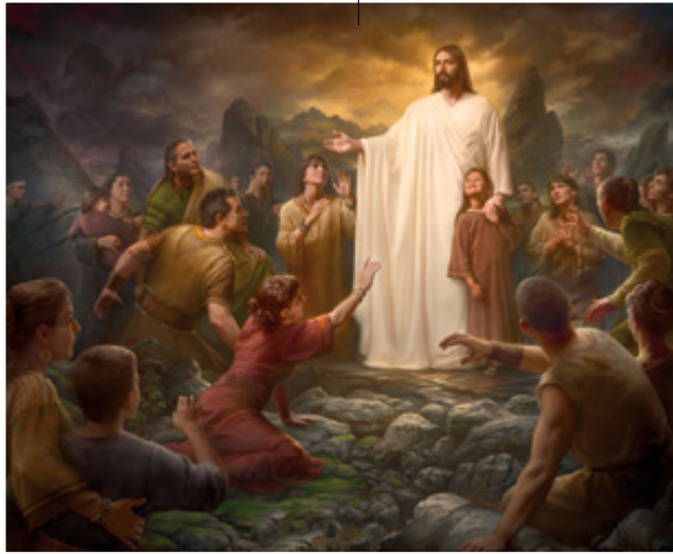
ONE SHEPHERD BY HOWARD LYON