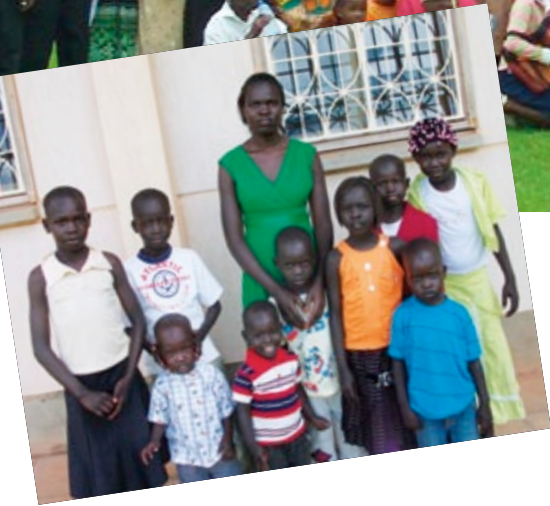
Top: Youth attend a stake fireside together.