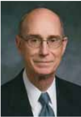
BY PRESIDENT HENRY B. EYRING