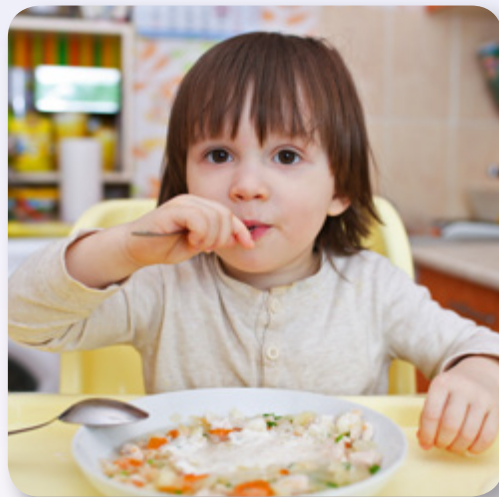
Soup is very popular in Russia! This boy is eating a cabbage soup called shchi .