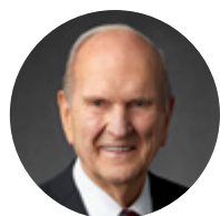
By President Russell M. Nelson