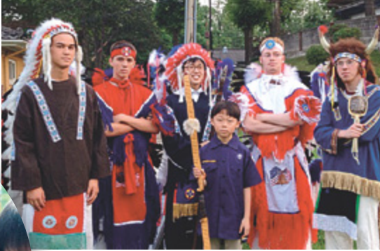
I am a citizen of both the United States and South Korea, so I take part in the Boy Scouts of America program at church.

I love football, and I play on an indoor field all year long.