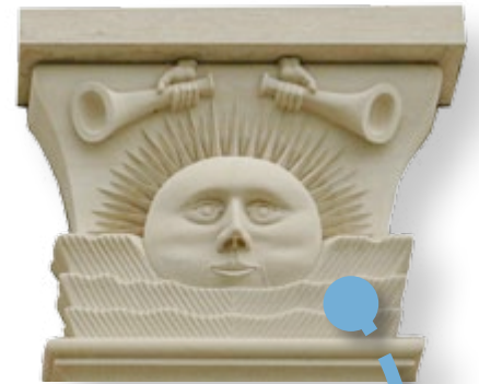
The original Nauvoo Temple had 30 sunstones.